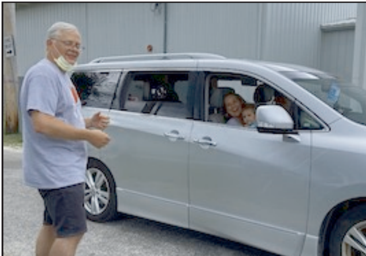
PMel Welcoming each car and directing them.