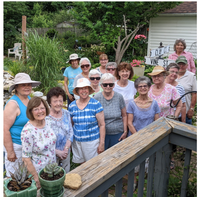
Members and friends of Hope Circle pause for a picture during their tour of homes on the 12th Annual Garden Walk

The members of Hope Circle appreciate those who were willing to share their gardens.