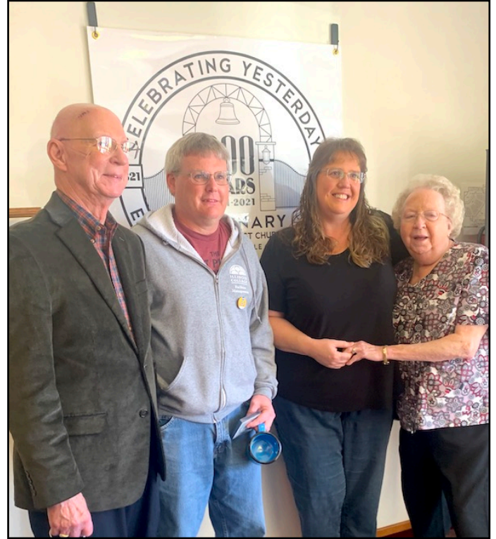
Special Worship Service recognizes 200 years