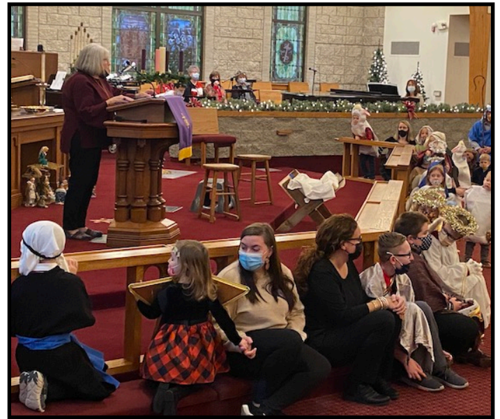
More photos and story from youth Christmas Program on page 12